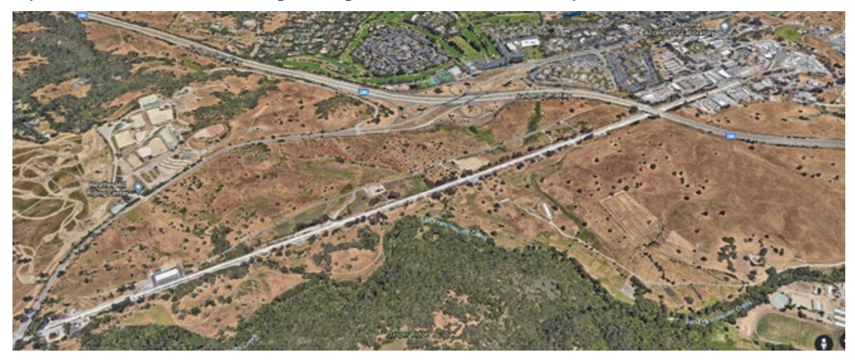
1-1. SLAC National Accelerator Laboratory site.

The Laboratory is located approximately 2 miles WSW of the main Stanford University campus, near the city of Menlo Park, in an unincorporated portion of San Mateo County, California.